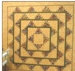
Mountain Medallion is much prettier than this pic! (I'm not too great at photography!)

MOUNTAIN MEDALLION: Date TBA. We originally scheduled this class too close to the holidays & although people LOVE the quilt, the class didn't fill. We will re-schedule ASAP, so get your name on the INTEREST LIST! Mountain Medallion is an awesome quilt, AND a variation of the classic "delectable mountains" block. You'll receive a FREE pattern with your paid class fees. Multiple sizes are available, so choose to make the center medallion on up to a king-sized quilt.