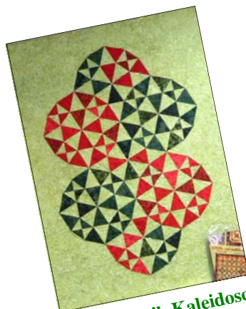
Traci's Batik Kaleidoscope ... GORGEOUS!

All this, plus 10% off STOREWIDE on everything you purchase on BOM day!